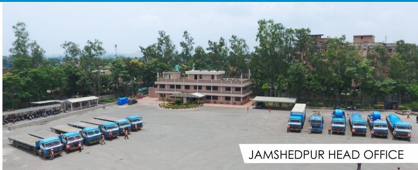
JAMSHEDPUR HEAD OFFICE

SAIZAR offers customized road transportation solutions for bulk commodities, construction equipment, excavators, tractors and all other trailerable goods. Our experienced management team will analyze your requirements and give you cost-effective solutions that can cater to your exact needs and add value to your supply chain.