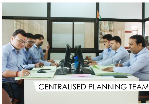
CENTRALISED PLANNING TEAM