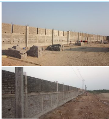
UPCOMING LOGISTICS PARK AT KALINGANAGAR, ODISHA