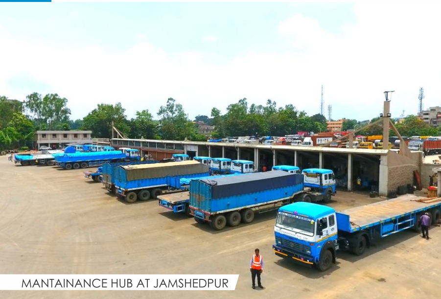
MANTAINANCE HUB AT JAMSHEDPUR