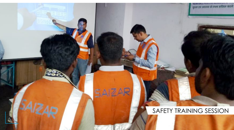
SAFETY TRAINING SESSION