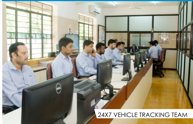
24X7 VEHICLE TRACKING TEAM